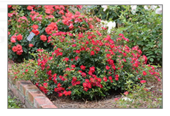
Red Drift Rose in bloom