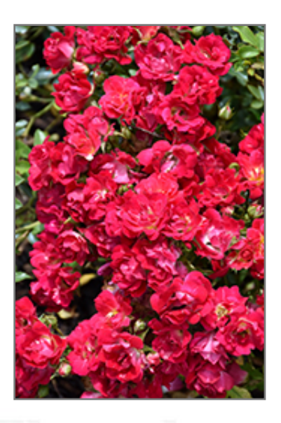
Red Drift Rose flowers

This shrub will require occasional maintenance and upkeep, and is best pruned in late winter once the threat of extreme cold has passed. Gardeners should be aware of the following characteristic(s) that may warrant special consideration;