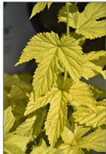
Golden Hops foliage