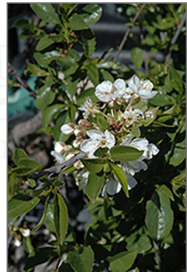
Romeo Cherry flowers