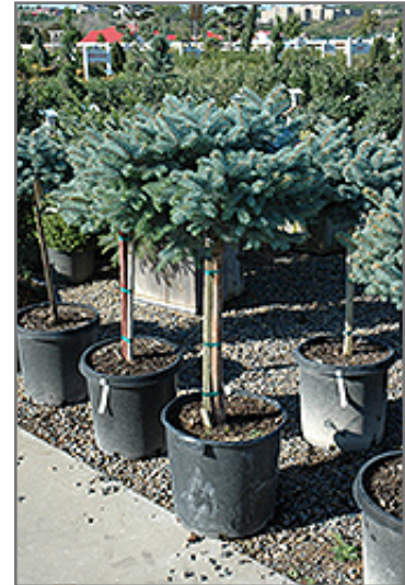
Globe Blue Spruce (tree form)