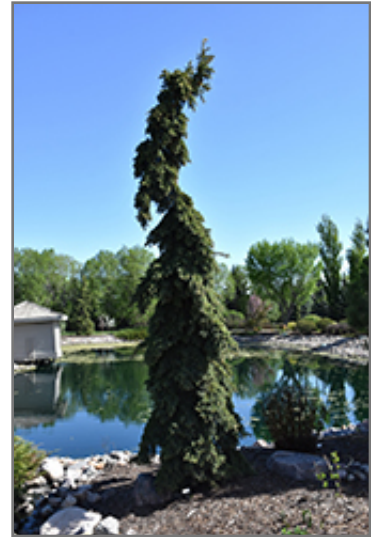
Weeping White Spruce

This tree does best in full sun to partial shade. It prefers to grow in average to moist conditions, and shouldn't be allowed to dry out. It is not particular as to soil type or pH. It is somewhat tolerant of urban pollution, and will benefit from being planted in a relatively sheltered location. This is a selection of a native North American species.