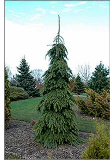
Weeping White Spruce