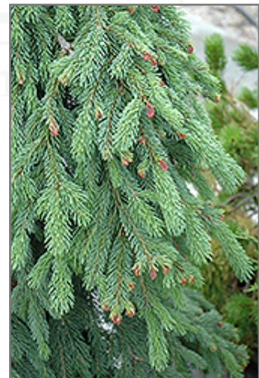
Weeping White Spruce foliage