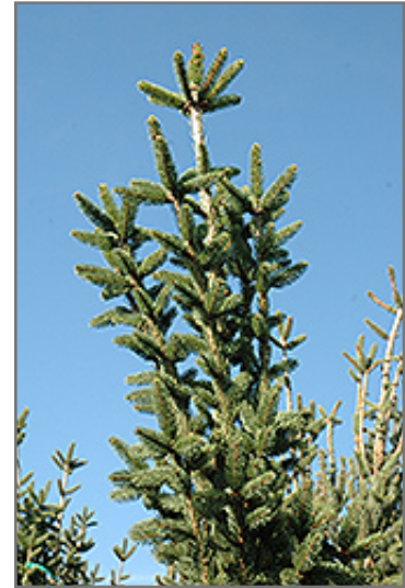
Columnar Norway Spruce foliage