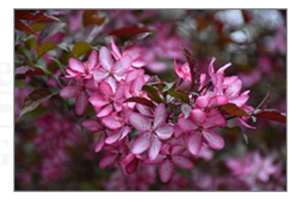
Royal Raindrops Flowering Crab flowers