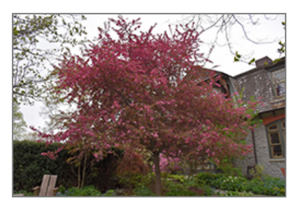
Royal Raindrops Flowering Crab in bloom

This tree will require occasional maintenance and upkeep, and is best pruned in late winter once the threat of extreme cold has passed. It is a good choice for attracting birds to your yard. It has no significant negative characteristics.