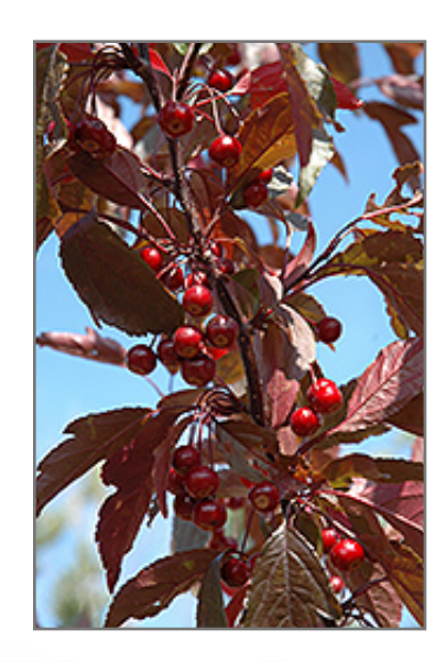
Royal Raindrops Flowering Crab fruit

This tree should only be grown in full sunlight. It prefers to grow in average to moist conditions, and shouldn't be allowed to dry out. It is not particular as to soil type or pH. It is highly tolerant of urban pollution and will even thrive in inner city environments. This particular variety is an interspecific hybrid.