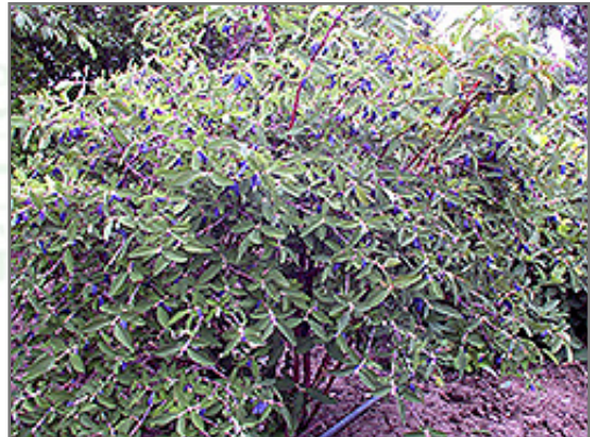
Blue Belle Honeyberry