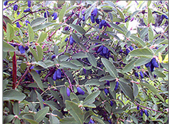
Blue Belle Honeyberry fruit

Blue Belle Honeyberry features subtle creamy white flowers along the branches in early spring. It has green foliage throughout the season. The narrow leaves do not develop any appreciable fall colour. It features an abundance of magnificent blue berries in late spring.