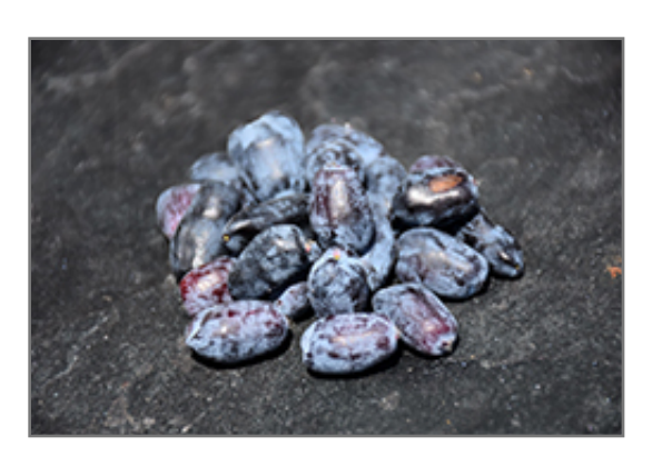
Berry Smart Blue Honeyberry fruit