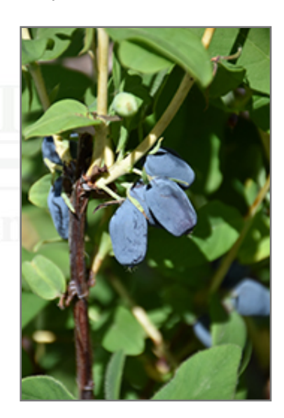
Berry Smart Blue Honeyberry fruit