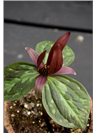
Prairie Trillium flowers