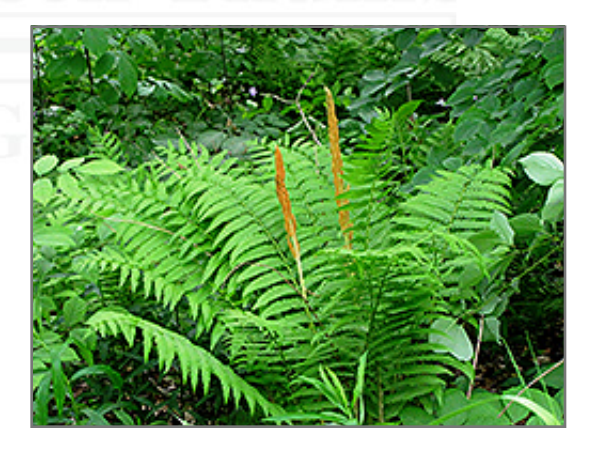
Cinnamon Fern in bloom