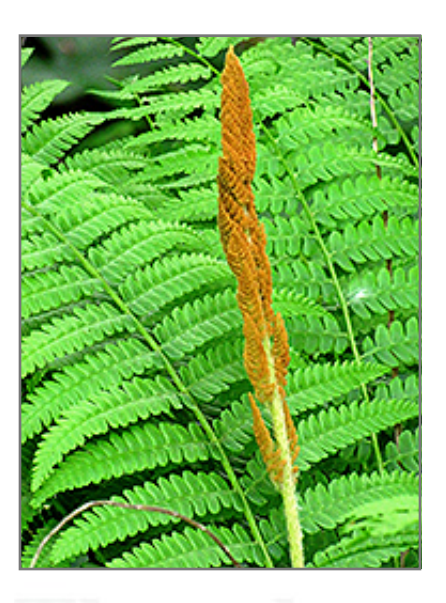
Cinnamon Fern flowers