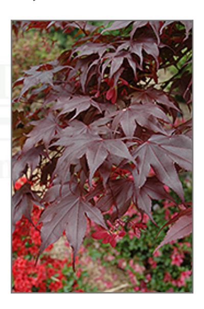
Bloodgood Japanese Maple foliage