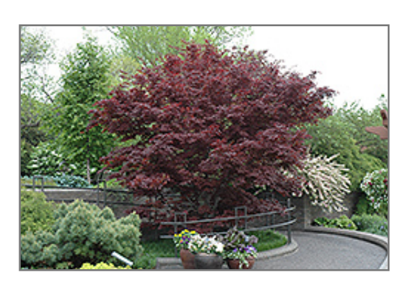
Bloodgood Japanese Maple

This is a relatively low maintenance tree, and should only be pruned in summer after the leaves have fully developed, as it may 'bleed' sap if pruned in late winter or early spring. It has no significant negative characteristics.