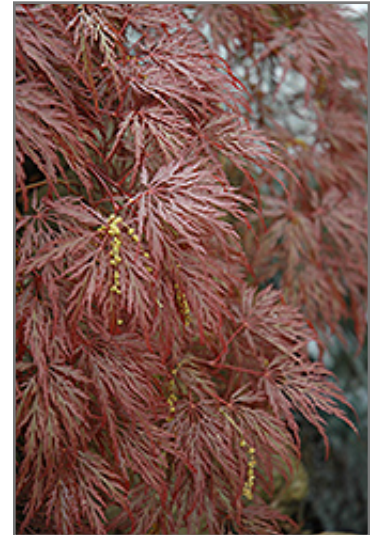
Inaba Shidare Cutleaf Japanese Maple foliage

Inaba Shidare Cutleaf Japanese Maple is recommended for the following landscape applications;