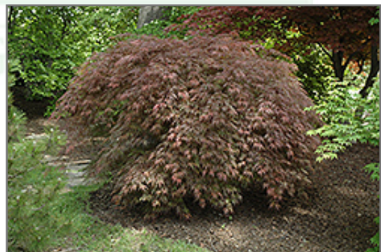
Inaba Shidare Cutleaf Japanese Maple