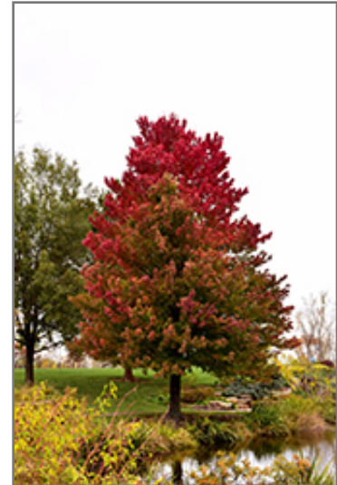
Red Sunset Red Maple in fall

Red Sunset Red Maple is recommended for the following landscape applications;