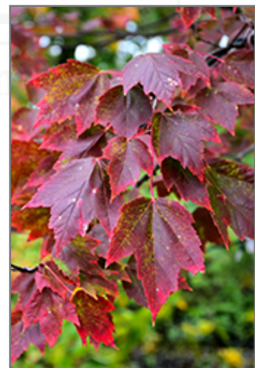
Red Sunset Red Maple in fall