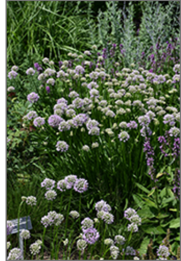
Summer Beauty Ornamental Chives in bloom

This plant should only be grown in full sunlight. It does best in average to evenly moist conditions, but will not tolerate standing water. It is not particular as to soil type or pH, and is able to handle environmental salt. It is highly tolerant of urban pollution and will even thrive in inner city environments. This is a selected variety of a species not originally from North America. It can be propagated by division; however, as a cultivated variety, be aware that it may be subject to certain restrictions or prohibitions on propagation.