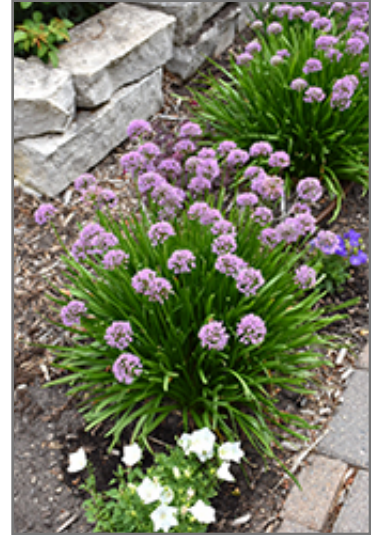
Summer Beauty Ornamental Chives in bloom

Summer Beauty Ornamental Chives is recommended for the following landscape applications;