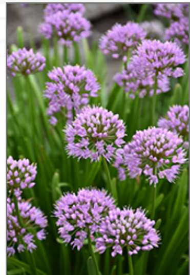
Summer Beauty Ornamental Chives flowers