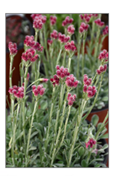
Red Pussytoes flowers

This native groundcover is ideal for xeriscaping; fuzzy silver leaves and rising pink flowers make this a unique addition to rock and alpine gardens; serves as a food source for the caterpillar for the Painted Lady butterfly