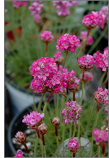
Splendens Sea Thrift flowers