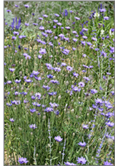
Cupid's Dart in bloom

Cupid's Dart will grow to be about 18 inches tall at maturity extending to 24 inches tall with the flowers, with a spread of 15 inches. Its foliage tends to remain dense right to the ground, not requiring facer plants in front. It grows at a medium rate, and under ideal conditions can be expected to live for approximately 4 years. As an herbaceous perennial, this plant will usually die back to the crown each winter, and will regrow from the base each spring. Be careful not to disturb the crown in late winter when it may not be readily seen!