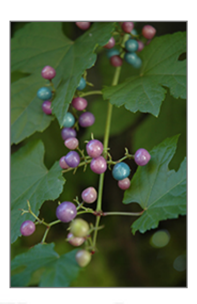
Elegans Porcelain Berry fruit

This woody vine does best in full sun to partial shade. It is very adaptable to both dry and moist locations, and should do just fine under average home landscape conditions. It is not particular as to soil type or pH. It is highly tolerant of urban pollution and will even thrive in inner city environments. This is a selected variety of a species not originally from North America.