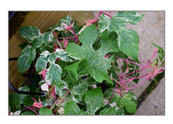
Elegans Porcelain Berry foliage