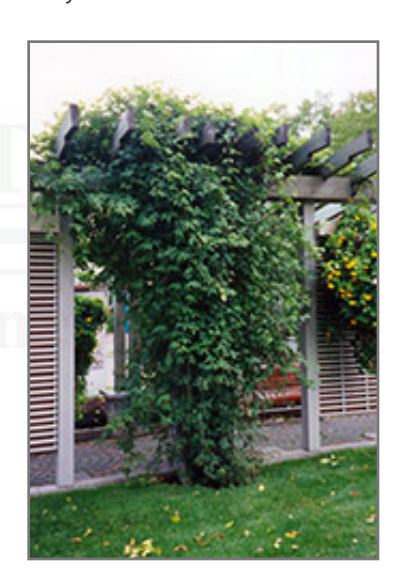
Elegans Porcelain Berry