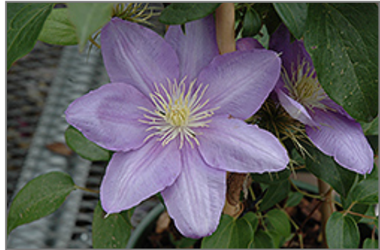
Cezanne Clematis flowers