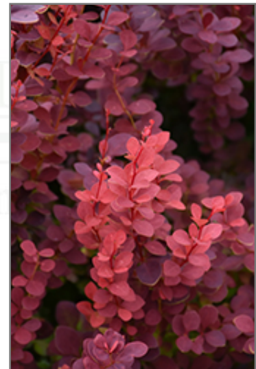
Ruby Carousel Japanese Barberry foliage