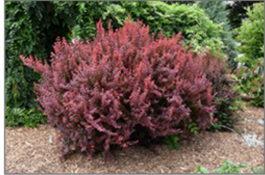
Ruby Carousel Japanese Barberry