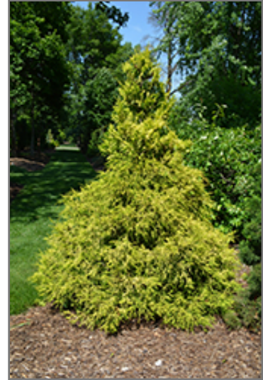
Golden Mop Falsecypress

Golden Mop Falsecypress is a multi-stemmed evergreen shrub with a more or less rounded form. It lends an extremely fine and delicate texture to the landscape composition which can make it a great accent feature on this basis alone.