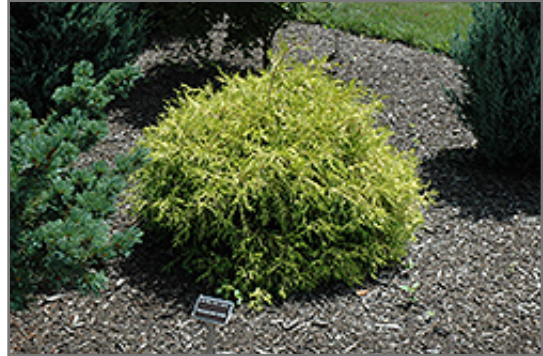
Golden Mop Falsecypress

This shrub does best in full sun to partial shade. It prefers to grow in average to moist conditions, and shouldn't be allowed to dry out. It is not particular as to soil type, but has a definite preference for acidic soils. It is highly tolerant of urban pollution and will even thrive in inner city environments. Consider applying a thick mulch around the root zone in winter to protect it in exposed locations or colder microclimates. This is a selected variety of a species not originally from North America.