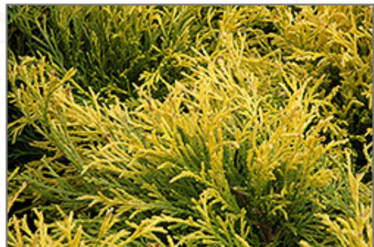
Golden Mop Falsecypress foliage