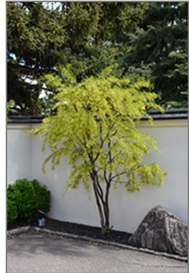
Lorbergii Peashrub in bloom

This shrub will require occasional maintenance and upkeep, and can be pruned at anytime. Gardeners should be aware of the following characteristic(s) that may warrant special consideration;