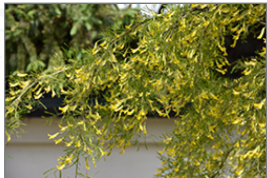
Lorbergii Peashrub flowers