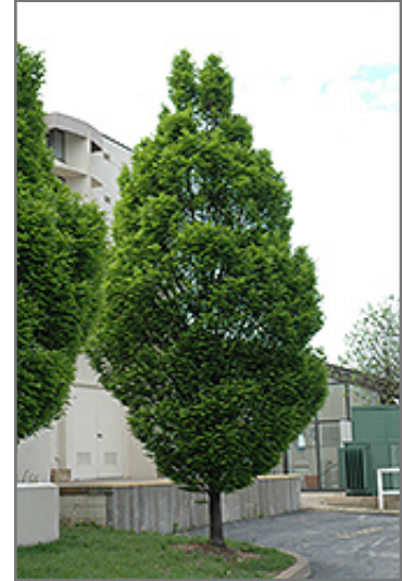
Pyramidal European Hornbeam