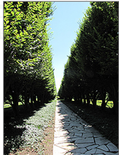
Pyramidal European Hornbeam