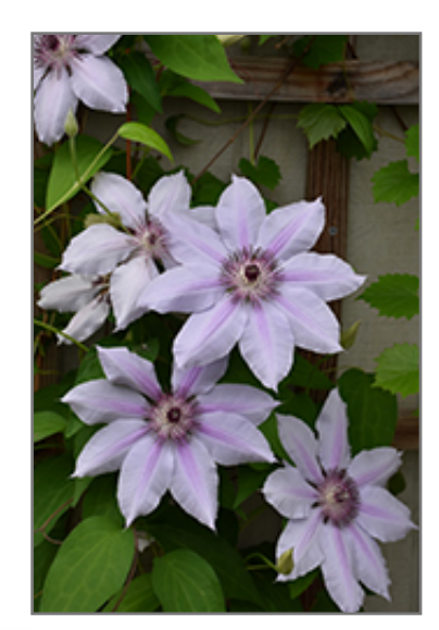
Nelly Moser Clematis flowers

Nelly Moser Clematis is recommended for the following landscape applications;