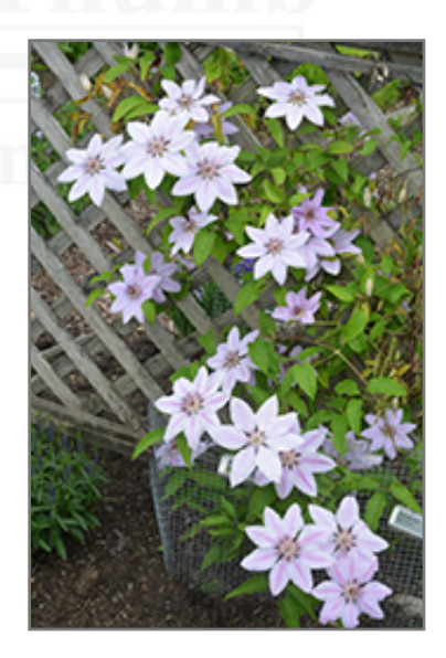
Nelly Moser Clematis in bloom