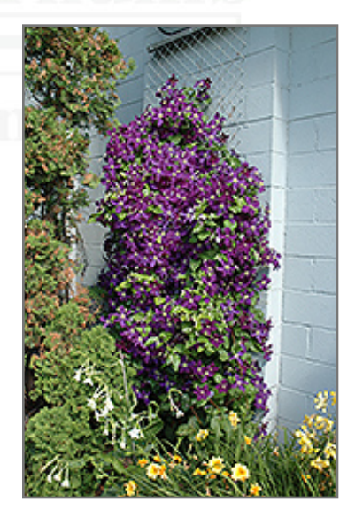
Jackmanii Superba Clematis in bloom