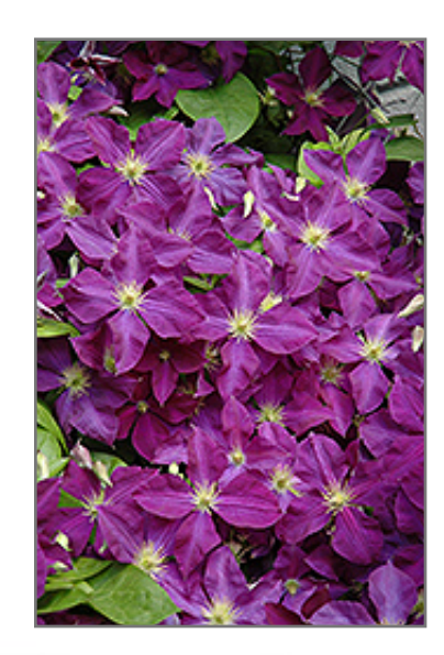
Jackmanii Superba Clematis flowers

Jackmanii Superba Clematis is recommended for the following landscape applications;