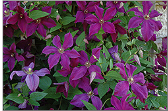
Polish Spirit Clematis flowers

Polish Spirit Clematis is recommended for the following landscape applications;