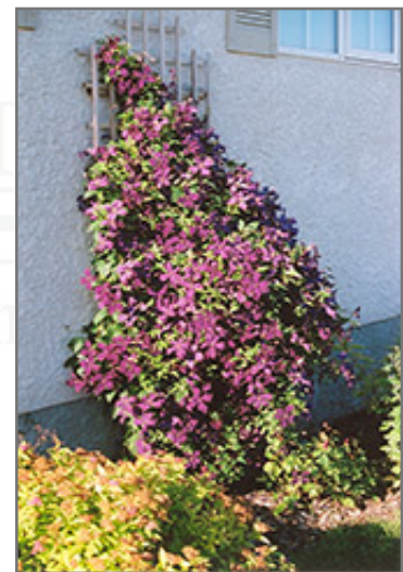
Polish Spirit Clematis in bloom