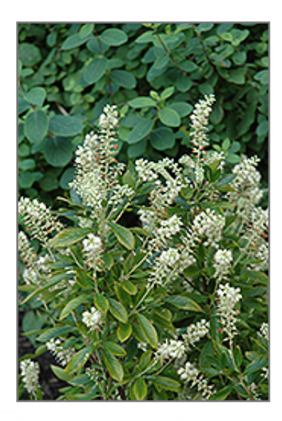
Hummingbird Summersweet flowers

This shrub will require occasional maintenance and upkeep, and is best pruned in late winter once the threat of extreme cold has passed. It is a good choice for attracting bees and butterflies to your yard. Gardeners should be aware of the following characteristic(s) that may warrant special consideration;