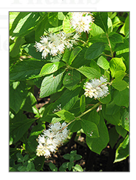
Hummingbird Summersweet flowers