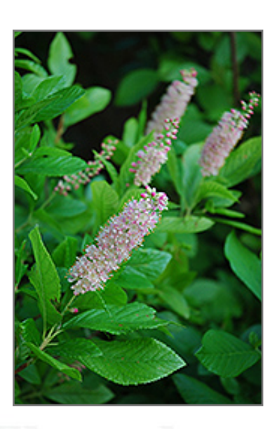
Pink Spires Summersweet flowers

Pink Spires Summersweet has masses of beautiful spikes of fragrant rose flowers rising above the foliage from mid to late summer, which are most effective when planted in groupings. It has green deciduous foliage. The glossy round leaves turn an outstanding harvest gold in the fall.