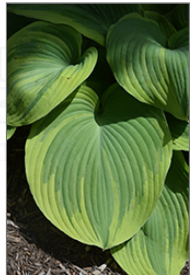
Earth Angel Hosta foliage