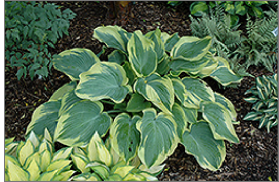
Earth Angel Hosta

Earth Angel Hosta is a dense herbaceous perennial with tall flower stalks held atop a low mound of foliage. Its medium texture blends into the garden, but can always be balanced by a couple of finer or coarser plants for an effective composition.