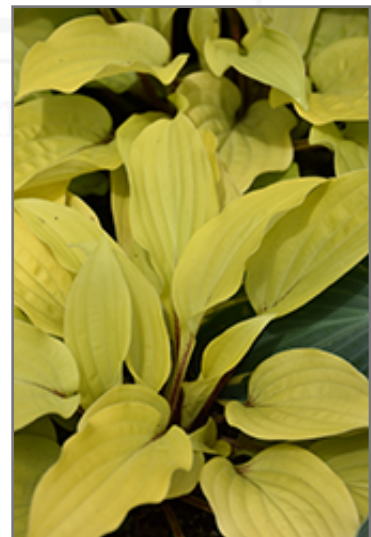
Fire Island Hosta foliage