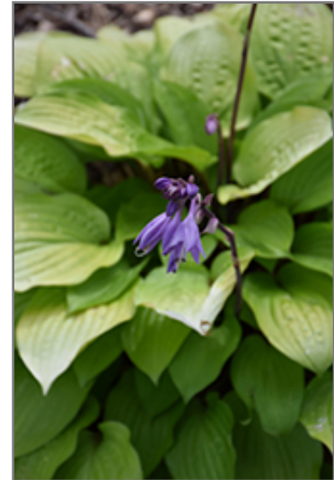
Fire Island Hosta flowers

This plant does best in partial shade to shade. It prefers to grow in average to moist conditions, and shouldn't be allowed to dry out. It is not particular as to soil type or pH. It is somewhat tolerant of urban pollution. This particular variety is an interspecific hybrid. It can be propagated by division; however, as a cultivated variety, be aware that it may be subject to certain restrictions or prohibitions on propagation.