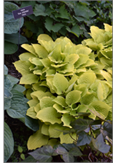
Fire Island Hosta