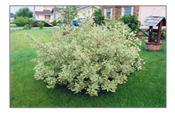
Silver Variegated Dogwood

Silver Variegated Dogwood is a multi-stemmed deciduous shrub with a more or less rounded form. Its average texture blends into the landscape, but can be balanced by one or two finer or coarser trees or shrubs for an effective composition.