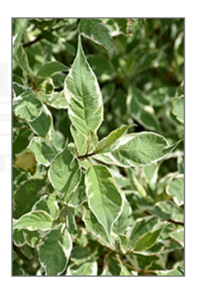
Silver Variegated Dogwood foliage

This is a relatively low maintenance shrub, and can be pruned at anytime. It has no significant negative characteristics.