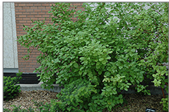
Siberian Dogwood