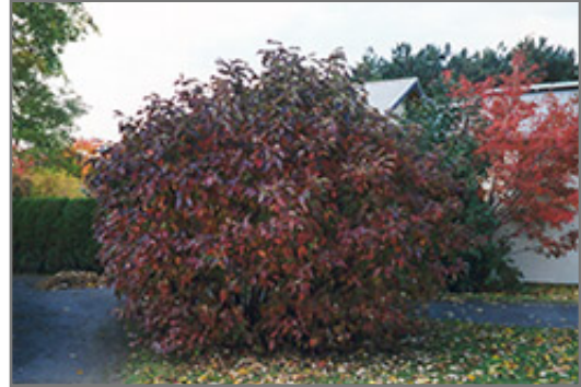
Siberian Dogwood in fall

This shrub does best in full sun to partial shade. It is an amazingly adaptable plant, tolerating both dry conditions and even some standing water. It is not particular as to soil type or pH. It is highly tolerant of urban pollution and will even thrive in inner city environments. This is a selected variety of a species not originally from North America.