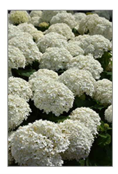
Incrediball Hydrangea flowers

Incrediball Hydrangea is recommended for the following landscape applications;