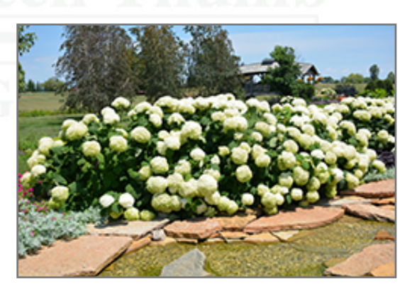
Incrediball Hydrangea in bloom