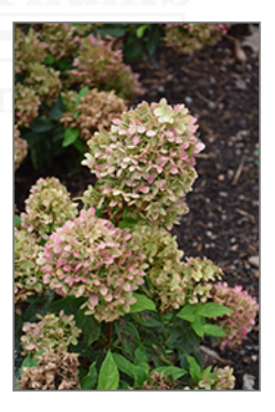
Little Lime Hydrangea flowers (faded)