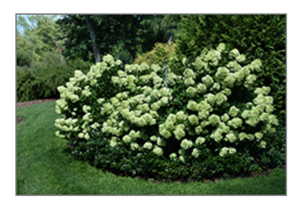
Little Lime Hydrangea in bloom

This shrub performs well in both full sun and full shade. It prefers to grow in average to moist conditions, and shouldn't be allowed to dry out. It is not particular as to soil type or pH. It is highly tolerant of urban pollution and will even thrive in inner city environments. Consider applying a thick mulch around the root zone in winter to protect it in exposed locations or colder microclimates. This is a selected variety of a species not originally from North America.