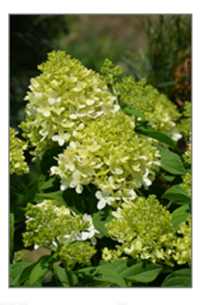
Little Lime Hydrangea flower buds

Little Lime Hydrangea is recommended for the following landscape applications;