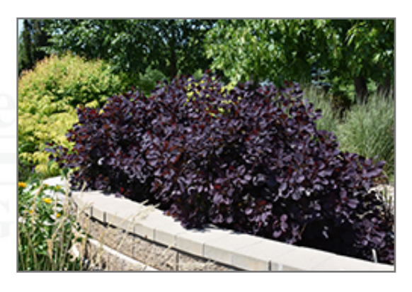
Royal Purple Smokebush