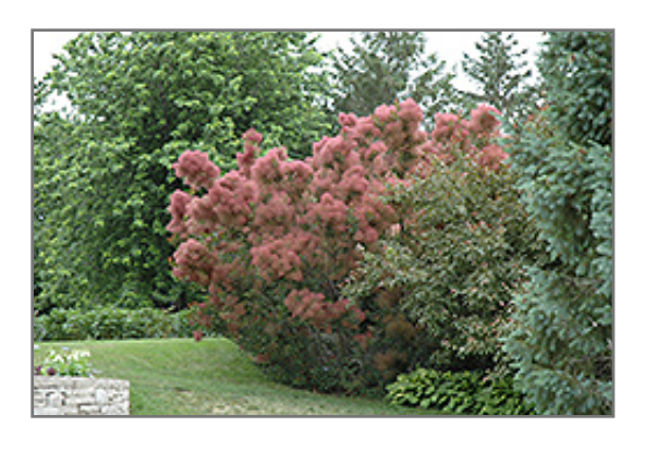
Royal Purple Smokebush in bloom

Royal Purple Smokebush is a multi-stemmed deciduous shrub with an upright spreading habit of growth. Its average texture blends into the landscape, but can be balanced by one or two finer or coarser trees or shrubs for an effective composition.