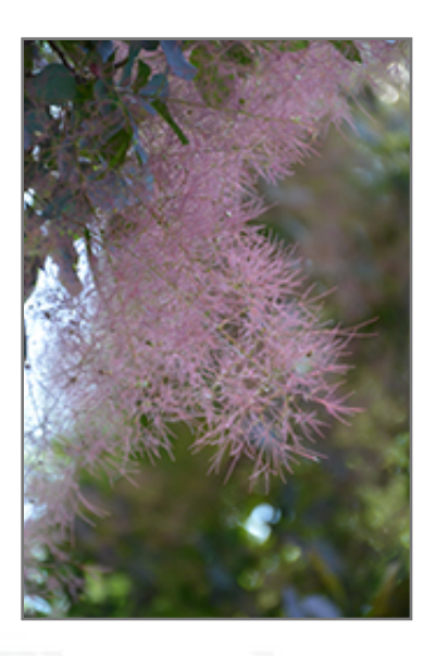
Royal Purple Smokebush flowers

Royal Purple Smokebush will grow to be about 10 feet tall at maturity, with a spread of 10 feet. It tends to be a little leggy, with a typical clearance of 1 foot from the ground, and is suitable for planting under power lines. It grows at a medium rate, and under ideal conditions can be expected to live for 40 years or more.