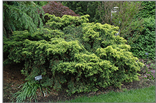
Saybrook Gold Juniper