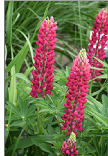
Popsicle Red Lupine flowers