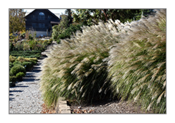
Gracillimus Maiden Grass

Gracillimus Maiden Grass is an herbaceous perennial with an upright spreading habit of growth. Its relatively fine texture sets it apart from other garden plants with less refined foliage.