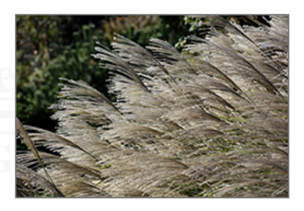
Gracillimus Maiden Grass fruit