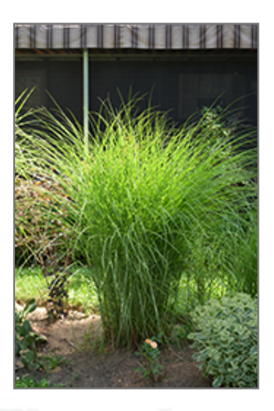
Gracillimus Maiden Grass

Gracillimus Maiden Grass will grow to be about 4 feet tall at maturity extending to 6 feet tall with the flowers, with a spread of 4 feet. It tends to be leggy, with a typical clearance of 1 foot from the ground, and should be underplanted with lower-growing perennials. It grows at a medium rate, and under ideal conditions can be expected to live for approximately 20 years. As an herbaceous perennial, this plant will usually die back to the crown each winter, and will regrow from the base each spring. Be careful not to disturb the crown in late winter when it may not be readily seen!