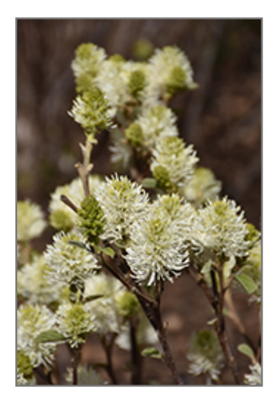
Mt. Airy Fothergilla flowers

This shrub will require occasional maintenance and upkeep, and should only be pruned after flowering to avoid removing any of the current season's flowers. Gardeners should be aware of the following characteristic(s) that may warrant special consideration;