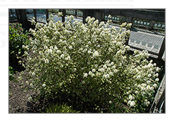
Mt. Airy Fothergilla in bloom