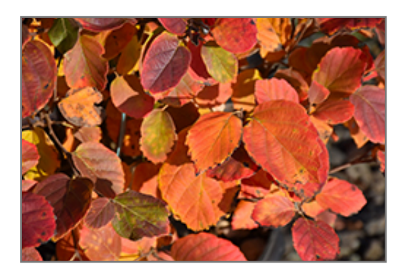
Mt. Airy Fothergilla in fall

Mt. Airy Fothergilla will grow to be about 6 feet tall at maturity, with a spread of 5 feet. It tends to fill out right to the ground and therefore doesn't necessarily require facer plants in front, and is suitable for planting under power lines. It grows at a slow rate, and under ideal conditions can be expected to live for 40 years or more.