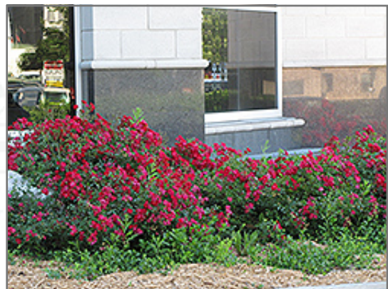
Flower Carpet Red Rose in bloom