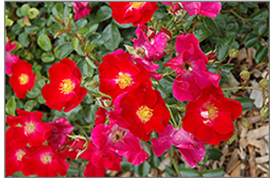
Flower Carpet Red Rose flowers

Flower Carpet Red Rose is a dense multi-stemmed deciduous shrub with an upright spreading habit of growth. Its average texture blends into the landscape, but can be balanced by one or two finer or coarser trees or shrubs for an effective composition.