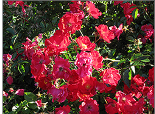
Flower Carpet Red Rose flowers