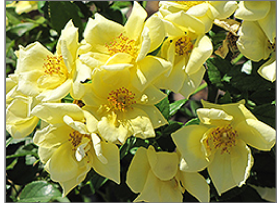
Flower Carpet Yellow Rose flowers