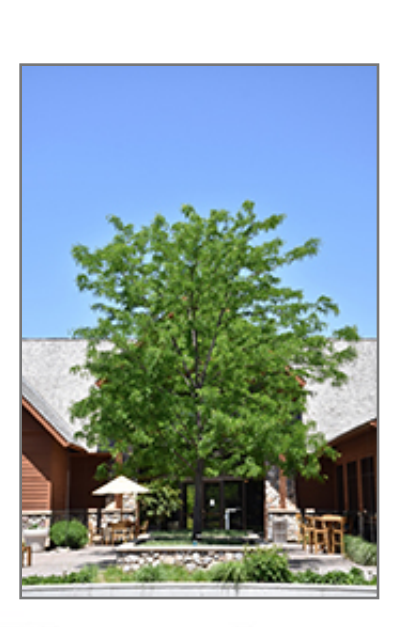
Skyline Honeylocust

Skyline Honeylocust has dark green deciduous foliage on a tree with a pyramidal habit of growth. The pinnately compound leaves turn an outstanding gold in the fall.