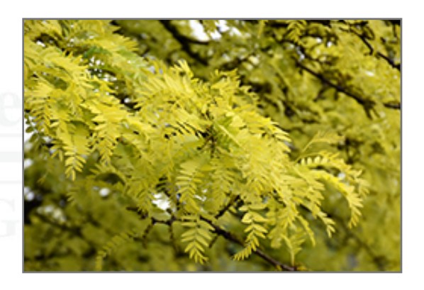
Sunburst Honeylocust foliage