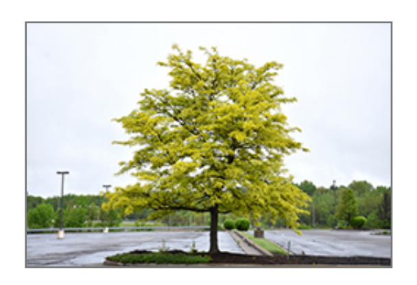
Sunburst Honeylocust

This is a relatively low maintenance tree, and is best pruned in late winter once the threat of extreme cold has passed. Deer don't particularly care for this plant and will usually leave it alone in favor of tastier treats. It has no significant negative characteristics.