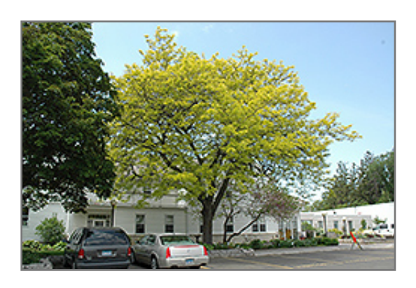
Sunburst Honeylocust

Sunburst Honeylocust will grow to be about 40 feet tall at maturity, with a spread of 35 feet. It has a high canopy with a typical clearance of 7 feet from the ground, and should not be planted underneath power lines. As it matures, the lower branches of this tree can be strategically removed to create a high enough canopy to support unobstructed human traffic underneath. It grows at a fast rate, and under ideal conditions can be expected to live for 70 years or more.