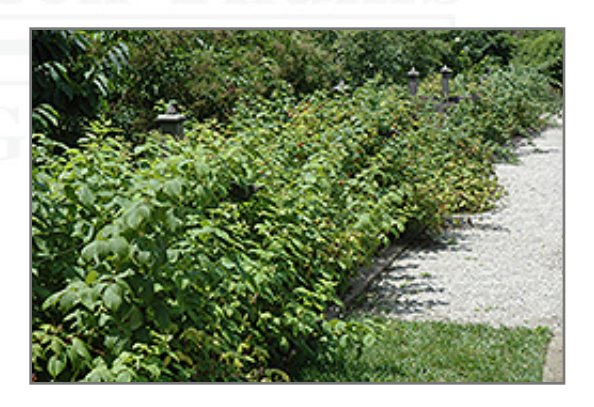
Heritage Raspberry