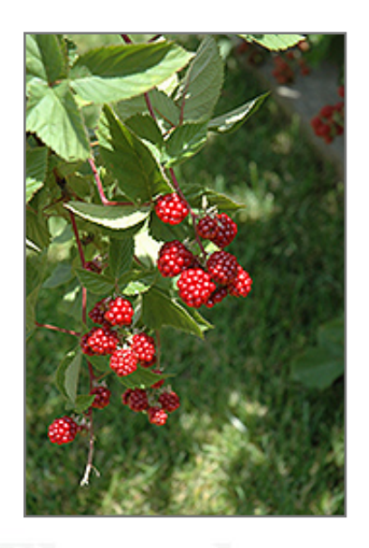
Heritage Raspberry fruit

Heritage Raspberry has rich green deciduous foliage on a plant with an upright spreading habit of growth. The fuzzy oval compound leaves do not develop any appreciable fall colour. It features an abundance of magnificent red berries from early summer to early fall.