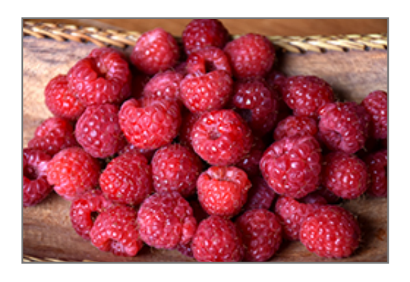
Heritage Raspberry fruit

Aside from its primary use as an edible, Heritage Raspberry is sutiable for the following landscape applications;