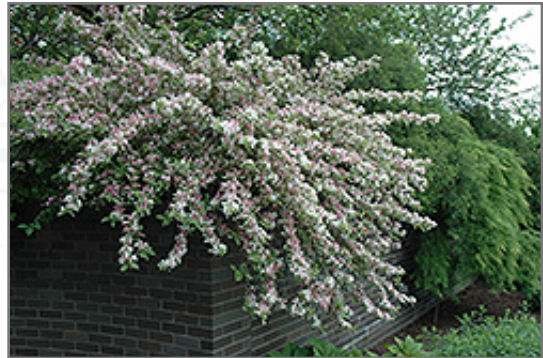
Dwarf Variegated Weigela in bloom