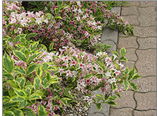
Dwarf Variegated Weigela flowers

Dwarf Variegated Weigela is recommended for the following landscape applications;