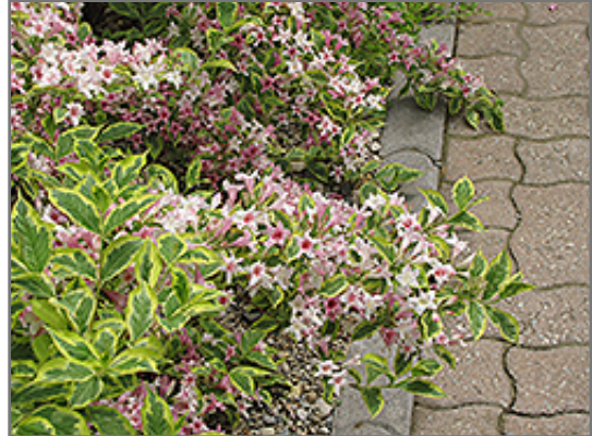
Dwarf Variegated Weigela flowers

Dwarf Variegated Weigela is recommended for the following landscape applications;