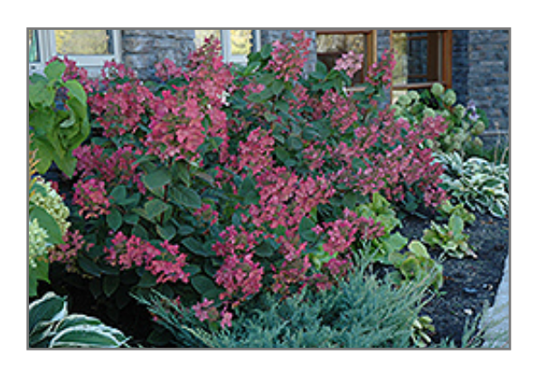
Pink Diamond Hydrangea in fall

Pink Diamond Hydrangea is recommended for the following landscape applications;