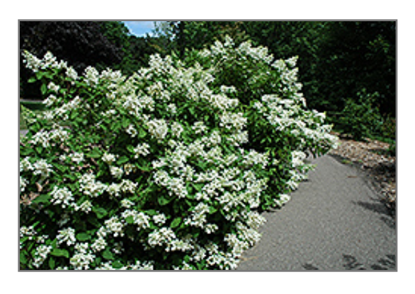
Pink Diamond Hydrangea in bloom

This shrub performs well in both full sun and full shade. It prefers to grow in average to moist conditions, and shouldn't be allowed to dry out. It is not particular as to soil type or pH. It is highly tolerant of urban pollution and will even thrive in inner city environments. Consider applying a thick mulch around the root zone in winter to protect it in exposed locations or colder microclimates. This is a selected variety of a species not originally from North America.