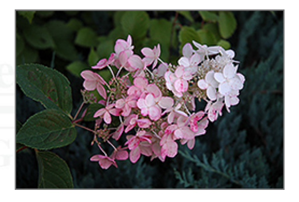
Pink Diamond Hydrangea flowers