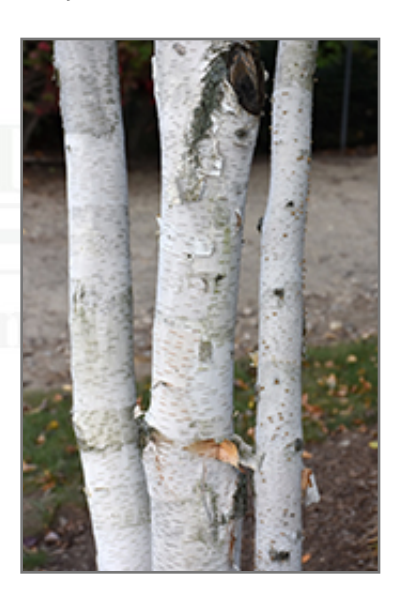
Whitebark Himalayan Birch bark