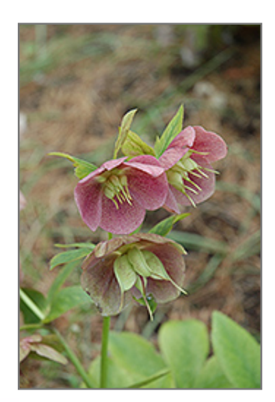
Pink Lady Hellebore flowers

A unique perennial that blooms in late winter and early spring; this variety has pretty pink and cream blooms; very showy, excellent for border plantings; protect from winter winds