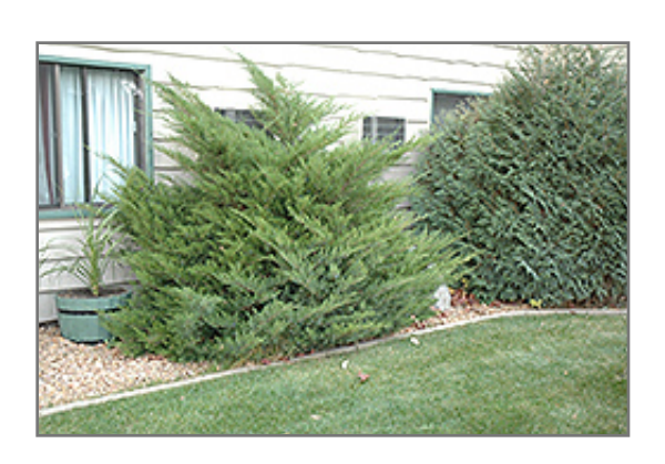
Mint Julep Juniper

A beautiful evergreen landscape shrub for general garden and massing use, features an upright arching branch habit with downturned tips, very attractive; deep green needle-like foliage; best in full sun